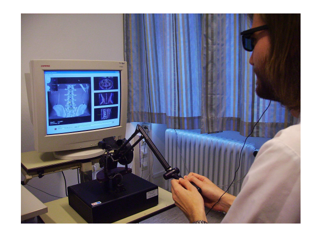
Figure 2. Trainee using the virtual lumbar punctur trainer using stereographic visualization with shutter glasses.

by means of viscosity, resisting force and friction. The synchronization of force feedback and miscellaneous visualization techniques provided a realistic impression of the anatomy. The trainees were motivated by the evaluation system to get the 'high score' for the best lumbar puncture.